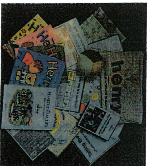
The HENRY Parent Toolkit – free to everyone joining a HENRY programme

The HENRY toolkit will help you give your child a great start in life, get the whole family involved, and keep track of how well you're doing.