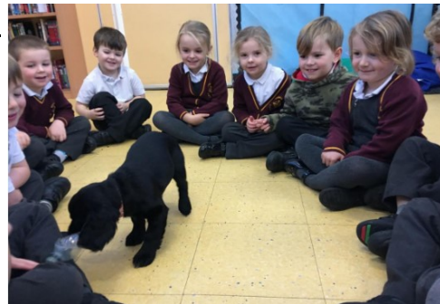
A visit from Jess: the Reading Dog.

into school. (See Jess—The Reading Dog.)