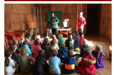
Arrival at Ford Castle