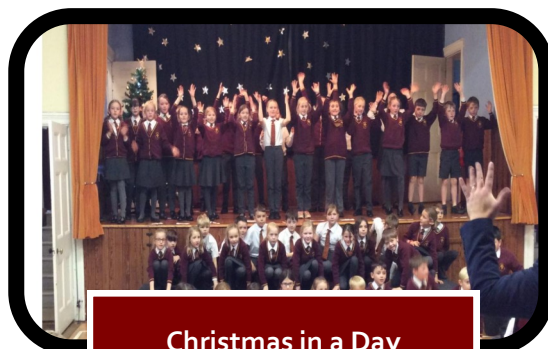
Christmas in a Day