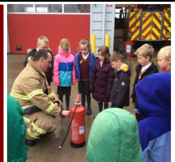
At the fire station.

In science they have been learning about the weather and the seasons. They made rain gauges to collect the rain and measure how much had fallen each day for a week. They had great fun doing this!