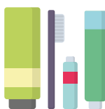
1 x Bag of toiletries (No aerosols please)