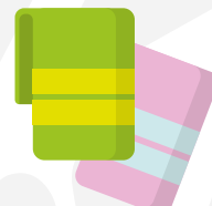
2 x Towels