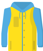
1 x Coat - ideally waterproof (For walking to centre)