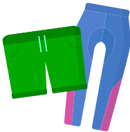
2 x Pair of shorts (knee length) (or leggings that can get wet)