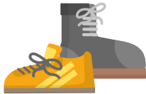
2 x Pairs of trainers