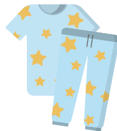
1 x Set of pyjamas