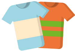
3 x T-Shirts (No vests please)

(This list includes what you'll wear to Robinwood)