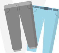
3 x Trousers (Ideally not jeans)