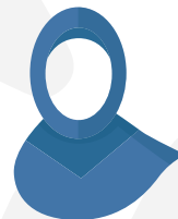
1 x spare Head Scarf (if you wear one)