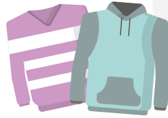
3 x Long Sleeve Tops (Jumpers/Hoodies etc)