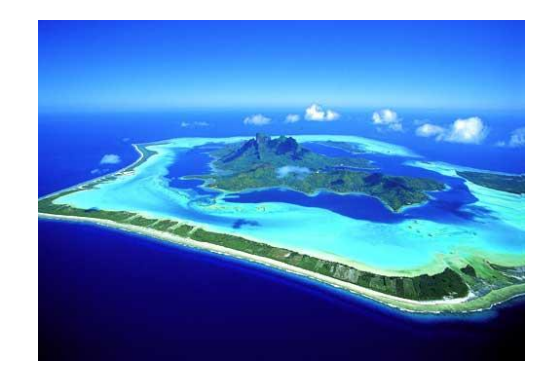
Bora Bora Lagoon, Bora Bora