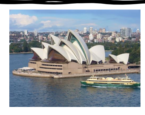
Sydney Opera House, Australia