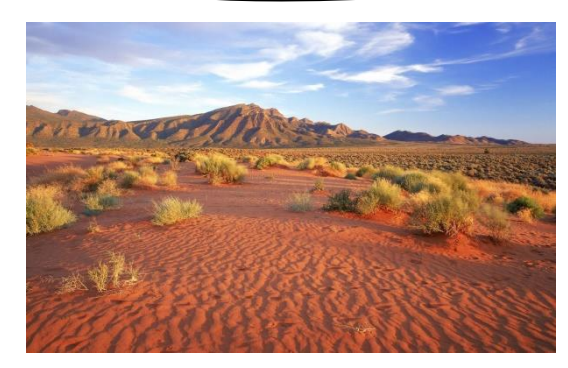
Areas of Central Australia are deserts