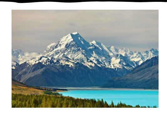
Mount Cook, New Zealand