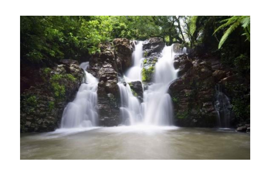
Tavoro Falls, Fiji