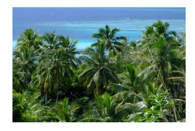
Many of the countries in Australasia also have some areas of Rainforest.