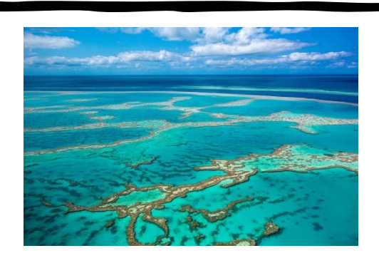
Great Barrier Reef, Australia