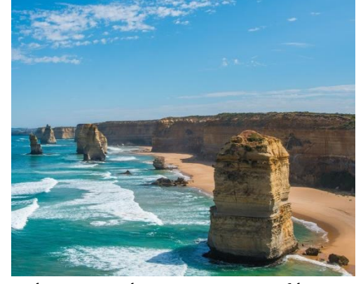
Twelve Apostles — a group of limestone stacks along the coast in Victoria.