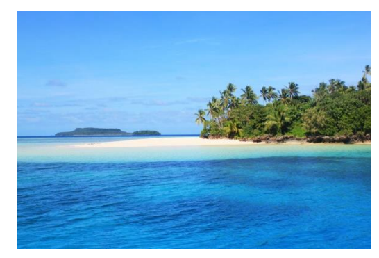
The continent is full of beautiful beaches and clear waters.