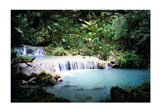
Several of the countries also have rock formations and waterfalls.