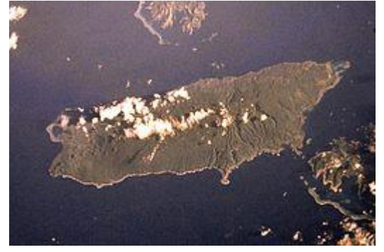
This is the volcano Taveuni in Fiji.