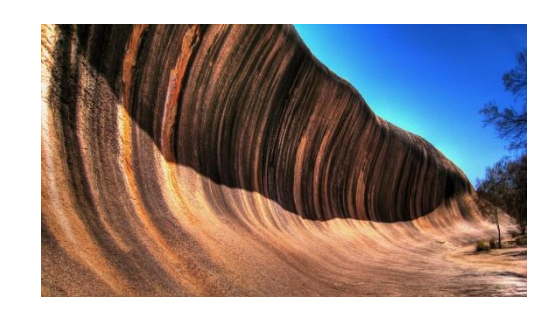
Wave Rock, Australia