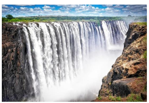
Victoria Falls, Zambia