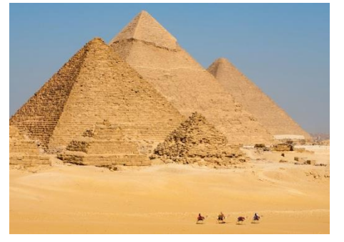
Pyramids of Giza, Egypt