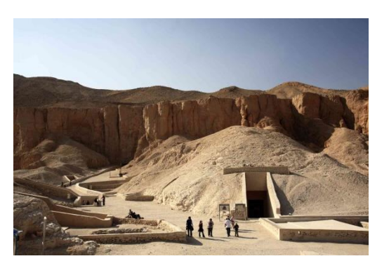
Valley of the Kings, Egypt