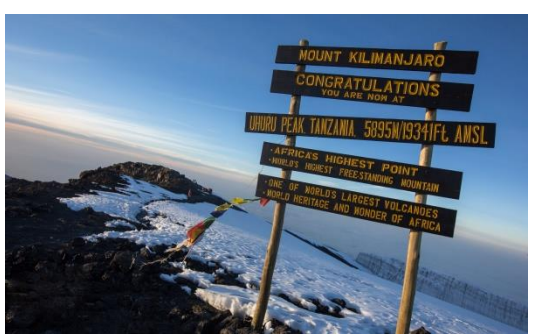
Mt Kilimanjaro, Tanzania