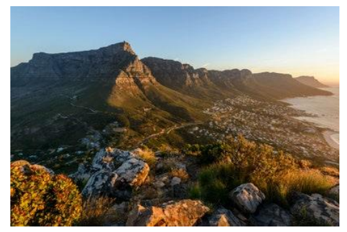
Table Mountain, South Africa