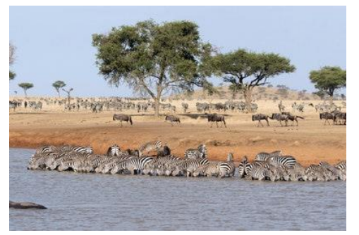
Serengeti National Park, Tanzania