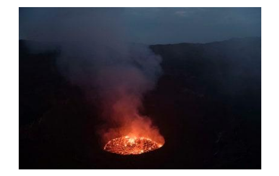
Mount Nyiragongo, Congo (Largest lava lake in the world)