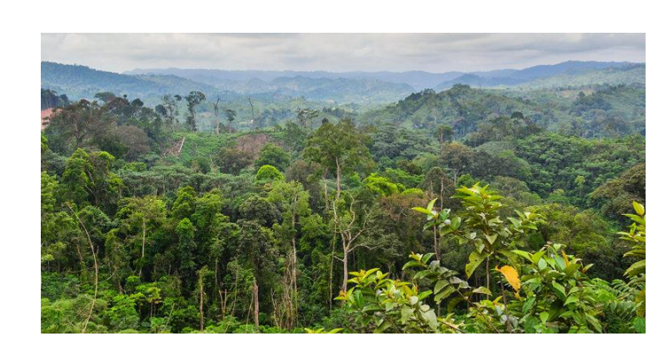
Africa also has areas of rainforest along the Congo river.

Lake Victoria is the largest lake in the world. It is in 3 different countries; Kenya, Uganda and Tanzania.