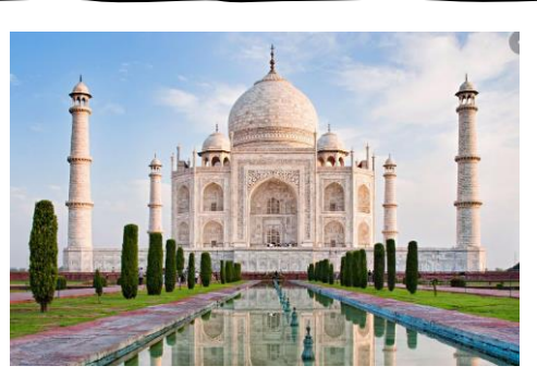
Taj Mahal, India