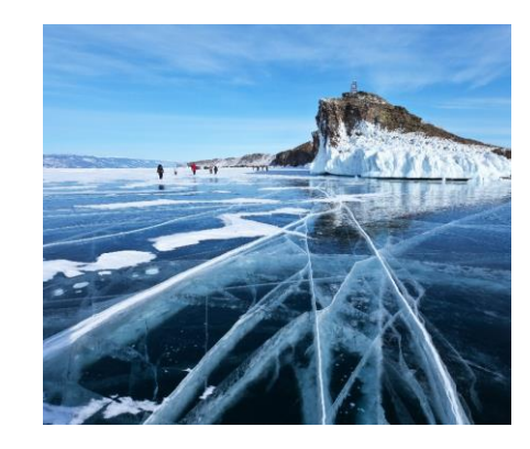
Lake Baikal, Russia, is the deepest and oldest lake in the world (25million years old).