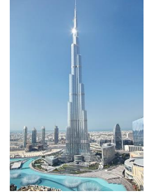
Burj Khalifa, Dubai, UAE