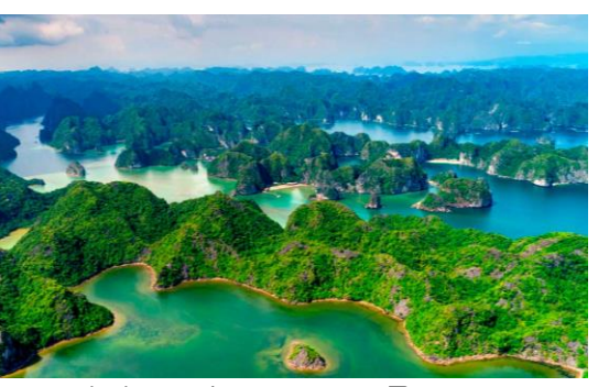
Ha Long Bay, Vietnam