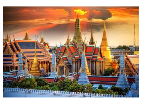
Grand Palace, Thailand