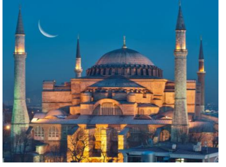
Hagia Sophia, Turkey