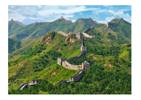
Great Wall of China, China