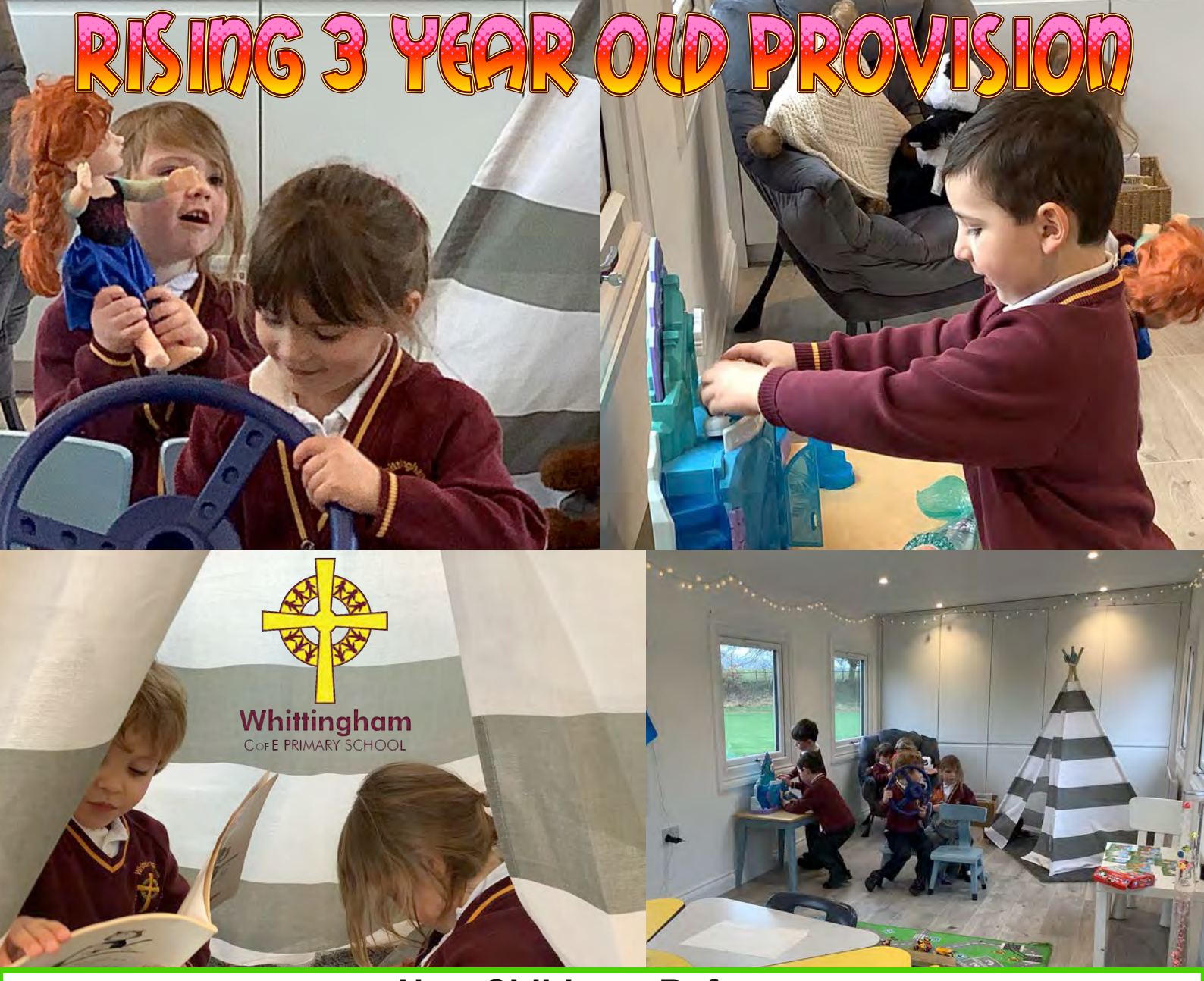
New Childcare Reforms

You may already be aware, starting from April 2024, existing childcare support will be expanded for working families. This means that: From April 2024 , working parents of 2-year-olds will be able to access 15 hours childcare support. Parents can apply for their funded childcare codes through the Childcare Choices website from 2<sup>nd</sup> January 2024.